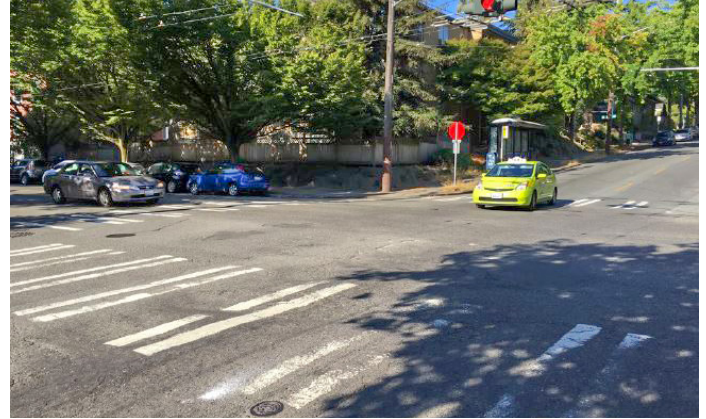
Intersection at E Thomas St and 19th Ave E

This spring, we're making improvements along E John St, E Thomas St and E Olive Way to increase visibility of people walking and biking at intersections without traffic signals. These improvements will enhance safety along this busy corridor served by King County Metro bus routes 8 and 10 and Sound Transit's Capitol Hill light rail station. This project was selected by the Levy to Move Seattle Oversight Committee in 2016 for funding through the Seattle Department of Transportation's (SDOT) Neighborhood Street Fund (NSF) program. The NSF program funds projects requested by the community.