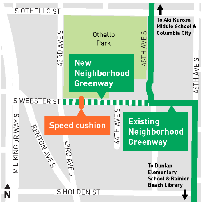
Map of the Othello Park Neighborhood Greenway

The Othello Park Neighborhood Greenway will provide a safe connection for students to schools in the neighborhood, and for people who walk and bike to other community destinations.