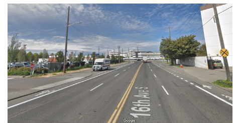
Existing: 16th Ave S (north of South Park Bridge)

— Protected bike lane option: One-way protected bike lanes on both sides of 16th Ave S leading to the South Park bridge