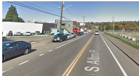
Existing: S Albro St