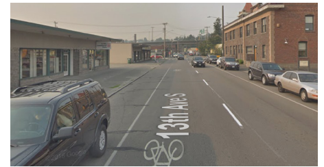
Existing: 13th Ave S