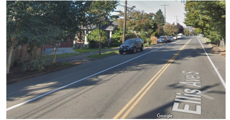
Existing: Ellis Ave S

— Ellis, Albro, 13th: A walking/biking path on Ellis Ave S, S Albro Pl, and 13th Ave S