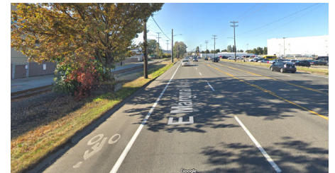
Existing: E Marginal Way S

— North side: A walking/biking path or protected bike lane on the north side of E Marginal Way