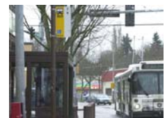
Of those who are unhappy with public transportation most would like more frequent buses and more service hours, especially weekend service. (survey question 11A)