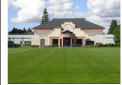
The South Park Community Center was the most frequently identified youth and community program provider in South Park. (Survey questions 15A, 16A, 19)