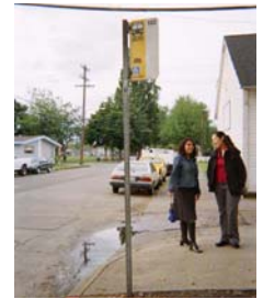
37% of those surveyed use the bus to travel outside the neighborhood, compared to 42% who drive. (survey question 9)