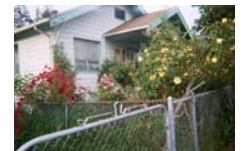
Location and affordability are the top two reasons why South Park survey respondents have chosen to live in South Park. (survey question 3)