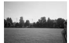
More parks, paths, and trails in their neighborhood is a priority among survey respondents. (survey question 5A)