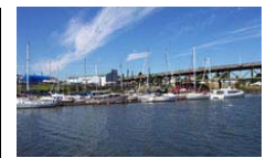
The Duwamish River was noted by many respondents as something they like about South Park. (survey question 7)