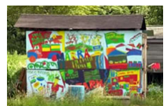
Marra Farm is among the top three community programs that survey respondents indicated they use in South Park. (survey question 19)