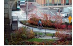
30% of survey respondents travel within South Park either on a bicycle or on foot. (survey question 8)

*Items 2.2f and 2.2g could be part of joint project.