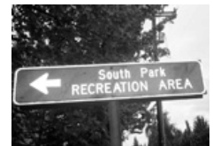
Parks and open spaces were most frequently listed as “Very Important” to making a neighborhood youth- friendly (survey question 14)