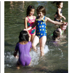
36% of survey respondents listed lack of information and communication as the number one reason for not knowing what programs are available for their children. (survey question 15b)