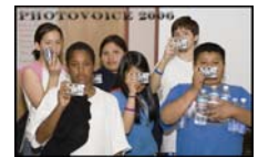
84% of survey respondents say they feel like part of the South Park community. They named positive relationships with their neighbors as the number one reason why they feel like a part of the community. (survey questions 4, 4a, 6)