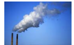
Survey respondents listed pollution, water, and air quality as the second most important of physical condition in the neighborhood that should be addressed immediately. (survey question 28)