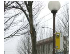
37% of those surveyed do not feel that South Park has adequate public transportation. (survey question 11)