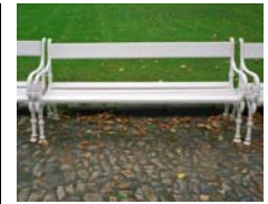
43% of survey respondents would prefer that Terminal 117 be converted to a park or open space. (survey question 28A)