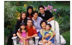
40% of survey respondents do not know what programs in South Park are available for the entire family. (survey question 18)