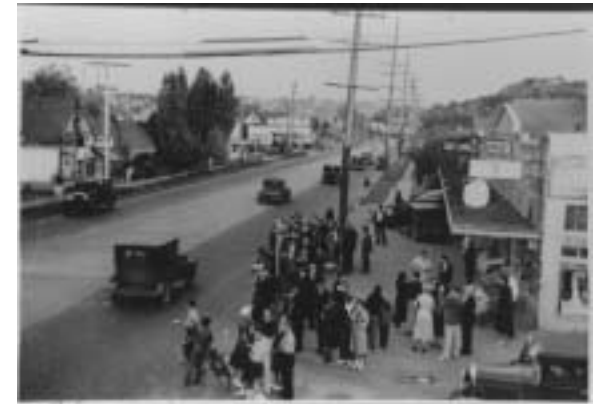
Rainier Avenue at Walden Street.

Several older houses are located on Rainier Avenue South and a few are still used as single-family dwellings. These include the Gill House at 3869 Rainier Avenue South, a one-story wood-frame cottage typical of early 20th century vernacular architecture, built in about 1906. The Foglia House at 4005 Rainier Avenue South dates from about 1913 and is a wood-frame structure with Craftsman detailing and some late Victorian characteristics. Carmino and Adelina Foglia, Italian immigrants, lived in other houses in the Rainier Valley before moving here in 1930. Their daughter-in-law, Helen Foglia, still lives in the house.