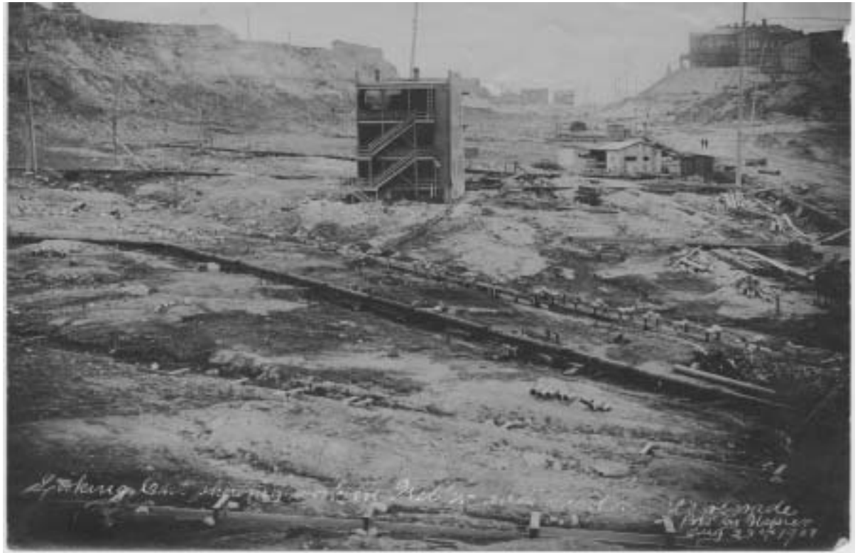
Dearborn Street under construction in 1909.