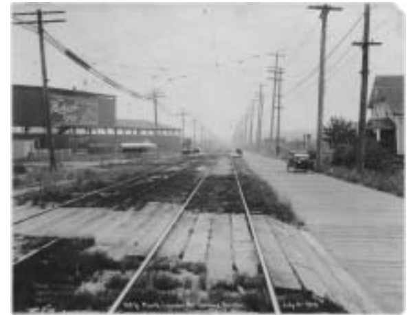
Rainier Avenue streetcar line near Dugdale Park, 1915.

Because of the predominantly Italian population, the north end of the Rainier Valley became known as “Garlic Gulch” or “Little Italy.” This neighborhood centered on South Atlantic Street and Rainier Avenue South.