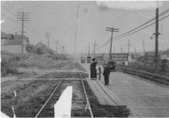
1915 photograph by Frank H. Nowell of streetcar tracks at Rainier Avenue and Oregon Street.

By this time, there was quite a bit of residential development north of Columbia City within a few blocks on either side of Rainier Avenue South. East of Renton Avenue South and north of South Alaska Street, a dairy farm was located at the future site of Rainier Vista (Sanborn, 1916-17).