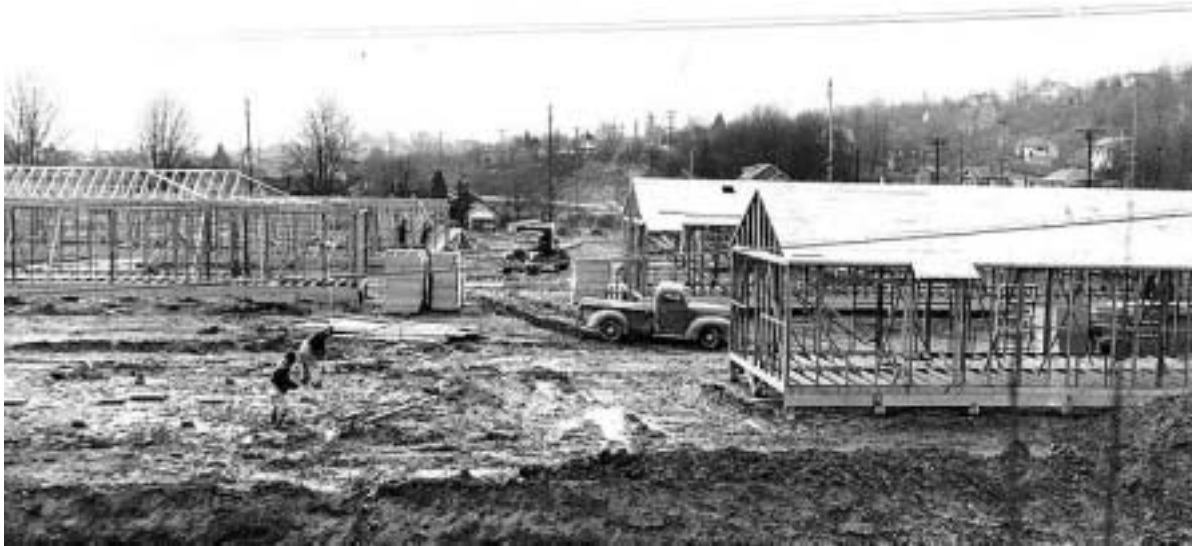
March 1943 photograph of Rainier Vista housing subdivision during construction.