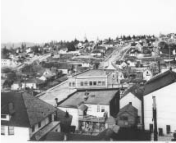
1908 photograph of Columbia City looking east along Edmunds Street.