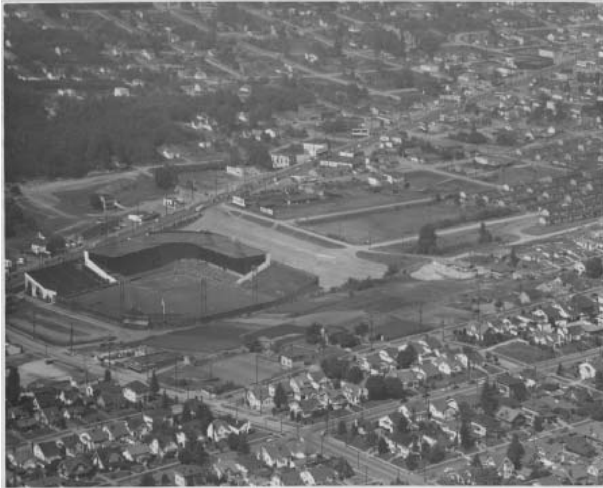
Aerial view of Sick's Stadium.

The Rainier Valley streetcar line went through many owners and had five different names, but it never made a profit for its owners. The Rainier Valley line was the last private streetcar line in the city, and Seattle was interested in purchasing it. However, by the 1930s electric streetcar lines were declining due to an increase in automobiles and buses. In the 1930s, the City of Seattle refused to renew the franchise for the Rainier Valley electric streetcar, and the last streetcar on the Rainier Valley line operated on January 1, 1937. In 1936, the City appropriated funds to pave Rainier Avenue South. The interurban line was replaced by gasoline buses, "trackless trolleys," in 1937 that operated on the same route as the old streetcar line (Blanchard 1966, 76-77).