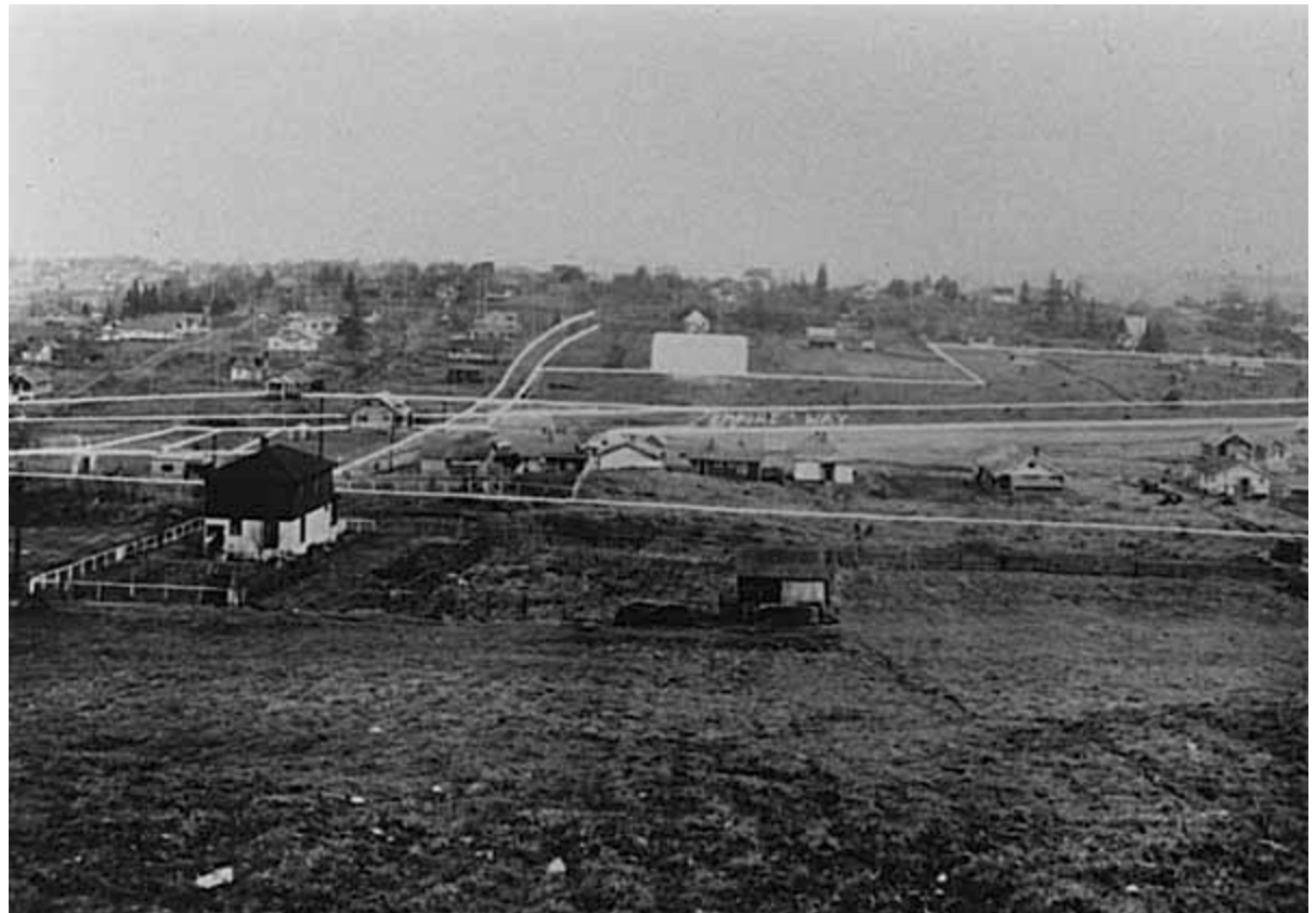
Ca. 1925 photograph of the planned route of Empire Way (changed to Martin Luther King Junior Way in 1983). James J. Hill, the railroad baron and “Empire Builder” was the namesake of the Empire Way.

The W.G. Savage Lumber Company constructed the first lumber yard at 1761 Rainier Avenue South in about 1920. Stewart Lumber and Hardware Company originated on the north end of Lake Union, and took over this yard in 1927. The complex of wood-frame buildings on Rainier Avenue was built in phases over a ten-year period. The Young family has owned Stewart Lumber since 1926. The Stewart Lumber Company is one of few remaining lumber businesses still operating in its original location and facility (Inventory form 1999).