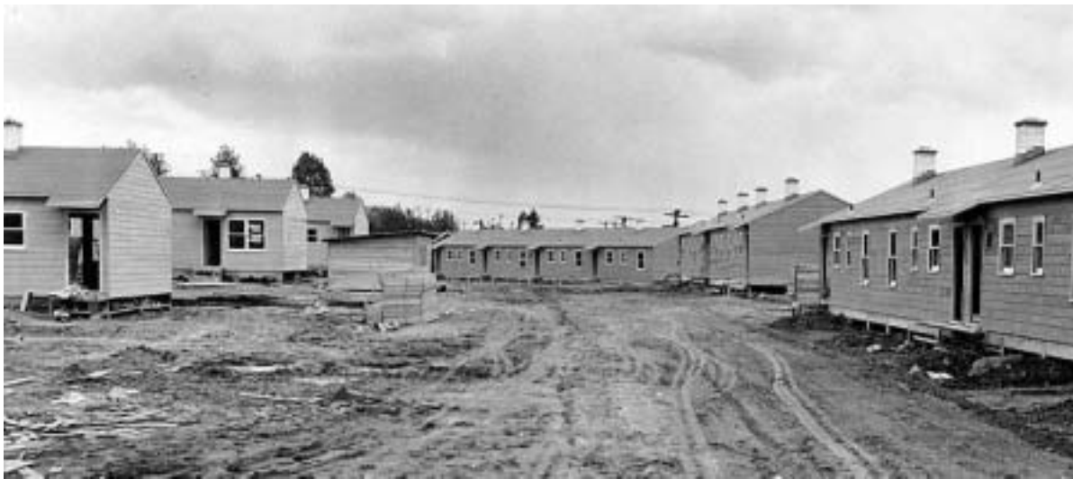
May 1943 photograph of Rainier Vista housing subdivision nearing completion.