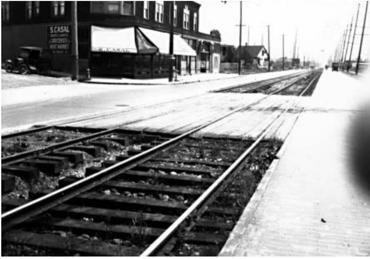
1925 photograph of Rainier Avenue at Atlantic Street.

The Occidental Sheet Metal Works at 2310 Rainier Ave South was designed by prominent Seattle architects Schack Young & Myers and completed in 1925. This one-story industrial building retains its original multi-paned wood sash windows and is quite intact (Sound Transit 1999, 123).