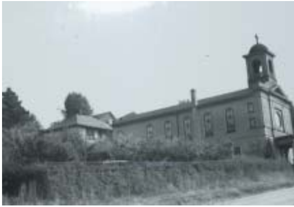
Photograph of Mount Virgin Church and adjoining orchard.