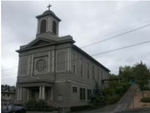
2003 photograph of Mount Virgin Church.

The 1910 Census showed 3,454 Italians in Seattle, and 1,519 were located in the second ward, which included the area south of Yesler and the north Rainier Valley. About 80 percent of those of Italian descent were truck gardeners in the Rainier and Duwamish valleys, and 20 percent were professionals (Roe 1915, 36).