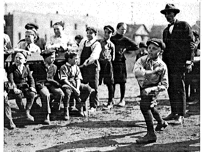
Ben Evans and youth participating in the "Old Woody" contest, n.d. Ben Evans Recreation Program collection, Item No. 31110

Ben Evans (1895-1988) also worked for the Parks Department and was director of the Recreation program for over 20 years, turning the program into one of the nation's major playfield and recreation systems. Photographs collected by Evans form part of the Ben Evans Recreation Program History Collection. The images number over 300 and include employees, participants in sporting events such as kite flying contests, the old Oswald and Old Woodenface contests, facilities in the Parks program, the skiing program at Snoqualmie, and Aqua Theater productions.