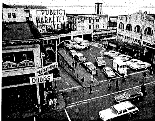
Corner of Pike Street and First Avenue, 1972 Pike Place Market Visual Images and Audiotapes Item No. 33293

Historical photographs were gathered from several sources and contemporary images were gathered from amateur photographers and project staff who documented various aspects of the Market and the project. A 1972 visual survey of building interior and exterior conditions in the historic district was conducted, and, in addition, the Project Office contracted with several photographers to document specific activities or physical elements of the Market.