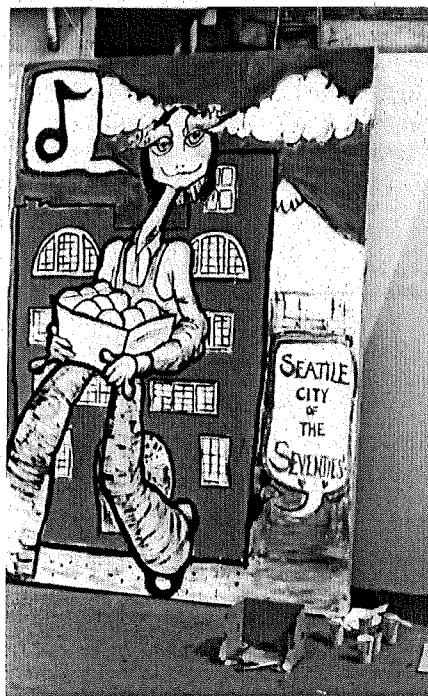
Corner Market Paint-In Artwork, 1975. Pike Place Market Visual Images and Audiotapes. Item No. 32106.

Over 4,500 slides of the Pike Place Market primarily document conditions of the structures within the project boundaries before, during, and after rehabilitation and construction. Also included are slides of Market activities, events, and celebrations, and images from public markets and urban renewal projects throughout the United States.